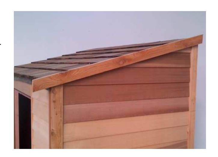
Step 17: Nail barge boards to ends of purlins, using 50mm bead nails. (1 nail per purlin)

Step 18: Ensure shed is square, by measuring internal diagonals at bottom corner of wall panels.