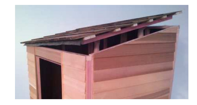
Step 13: Position roof panel on shed as shown.

Step 14: Using 75mm tek screws, screw roof panel into end wall panels, (2 screws each end).